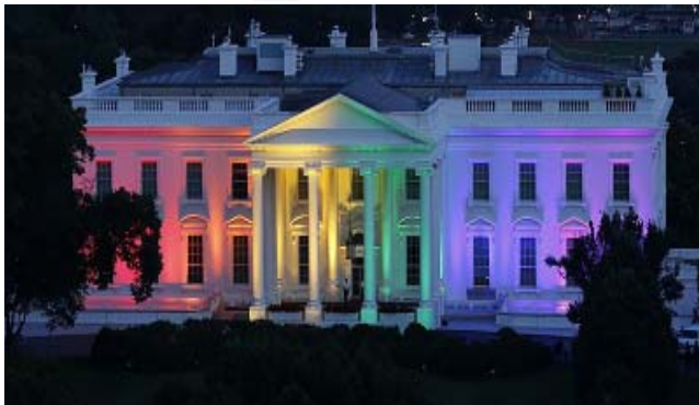
Fig. 3 White House lit with rainbow