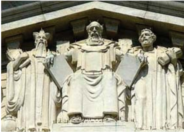
Fig. 1 Moses with Ten Commandments

Now the simple question is this: Do you now understand why the United States is listed as a hot spot? Do you now understand why God has lifted His hedge of protection and our place within God's grace has been removed? God is not pleased with this nation! The sleeping giant of Christian believing people must awaken and group together as a nation, not by denomination, for a serious revival. If this nation does not change its attitude toward God and each other, we could be headed for another revolution!