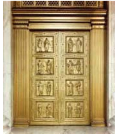
Fig. 2 Door at Supreme Court