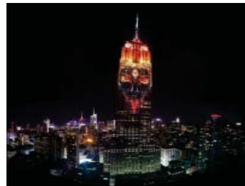
Fig. 4 Empire State Bldg. w/Kali