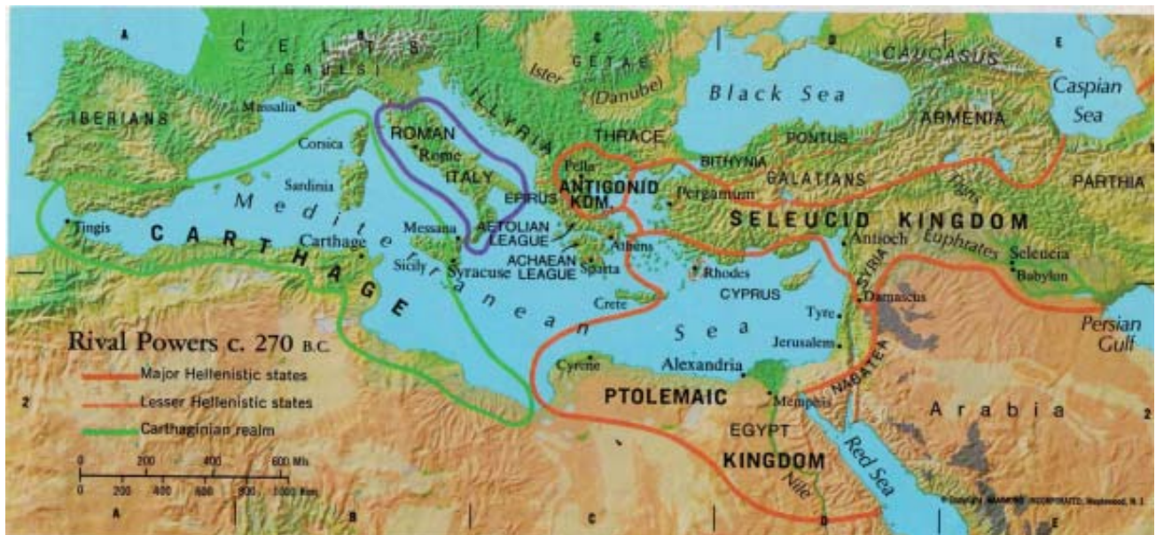
Map 4 - represents the four kingdoms established after the death of Alexander by his four generals. Notice also that the influence of the Roman empire, at that time, was only over the country of Italy.