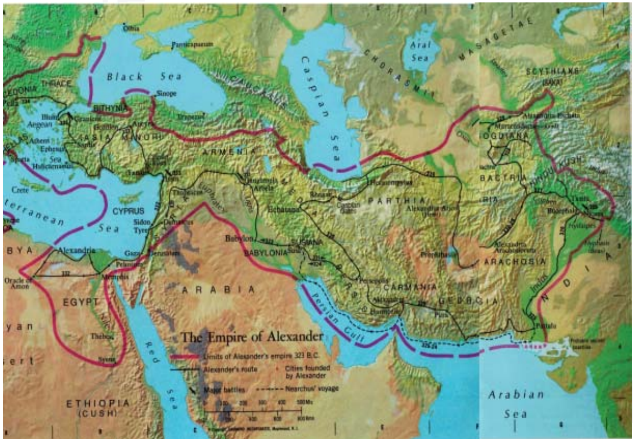
Map 3 - Representing the Grecian Empire of Alexander the Great, depicted as the Leopard.