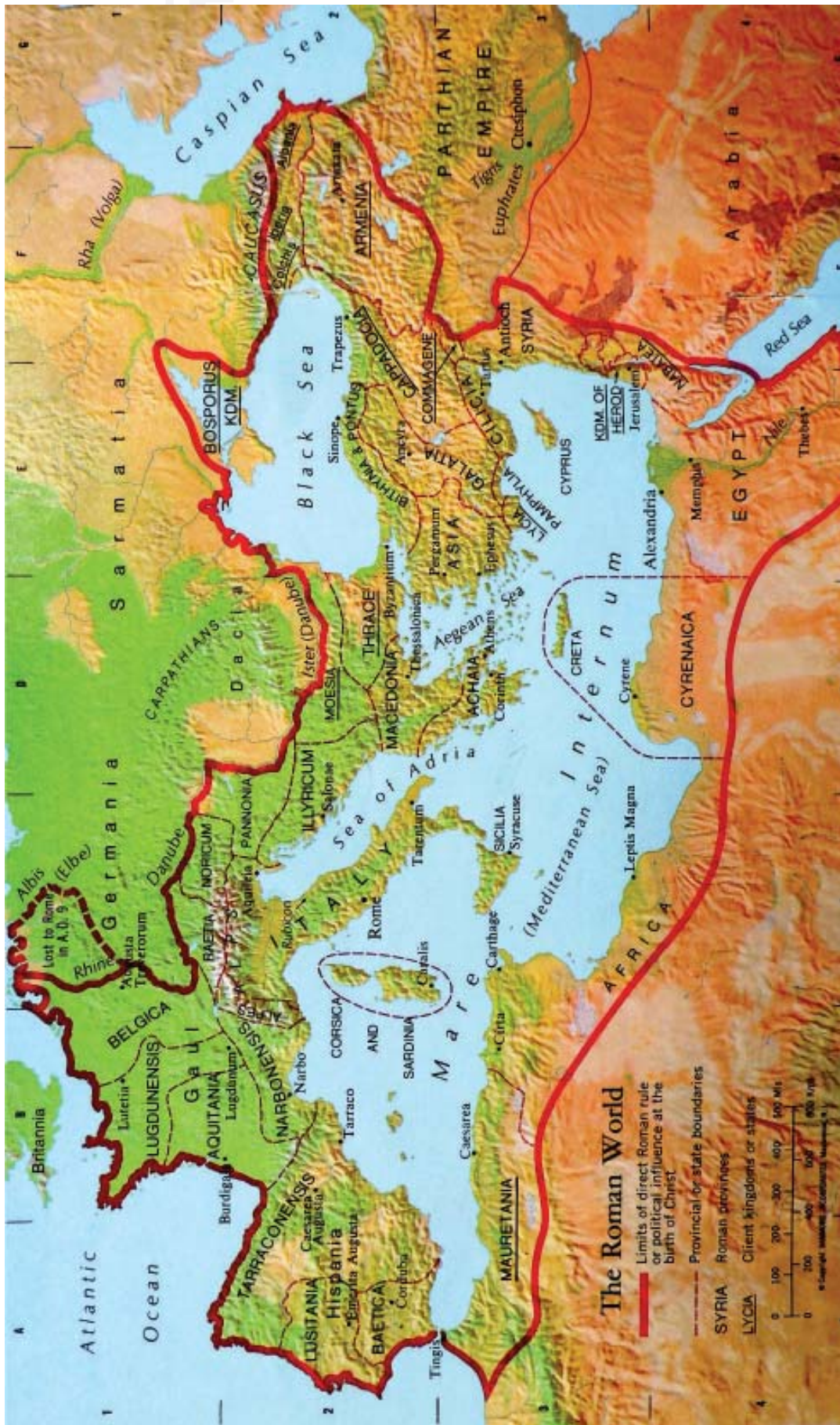
Map 6 - Area of control of the Roman Empire.