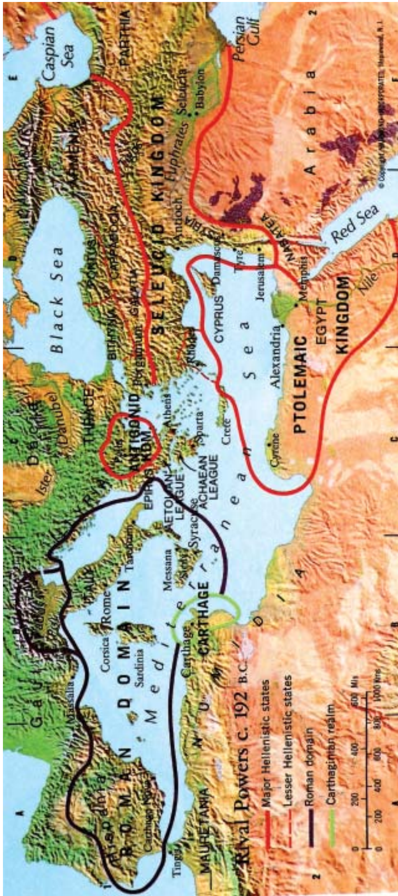
Map 5 - Illustrates the Rival Powers in c. 192 B. C. and the enlarging of the Roman Empire.