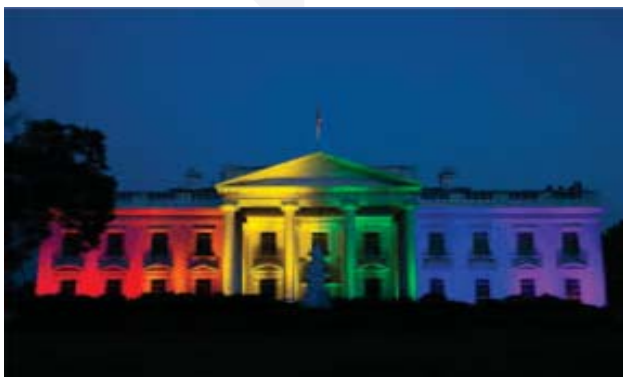
Fig. 3 White House lit with rainbow